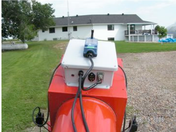
Picture showing control box mounted on swing hopper head.

Mount the control box on the swing auger head by drilling four ¼" holes and using four ¼" bolts. Make sure that the motor control cord and lighted buzzer is facing the motor.