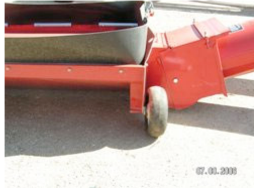
3 wheeled hopper where the angle iron mount will be bolted-typical 10"