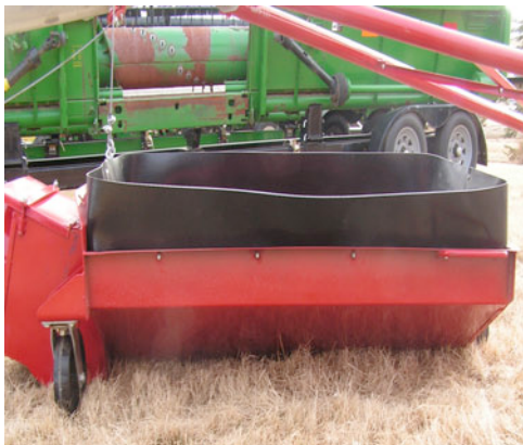
Typical 12" 3 wheeled hopper with the inside hopper wheels that swivel.