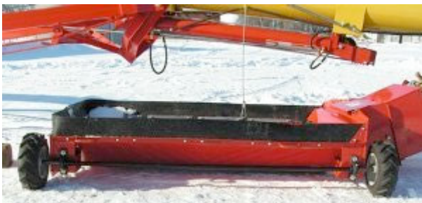
Picture showing hopper with axle, bearings and wheels installed.

After getting holes drilled, mount pillow blocks with four \frac{3}{8} x 1\frac{1}{2} " and slide the axle shaft in to the bearings. Slide the hub and wheel assemblies on to the ends of the shaft. Position shaft so that the tires clear the hopper by 1" and leave 2-4" of shaft sticking past inside tire so the driveshaft can be mounted. (in some instances you can cut off one end or both ends of axle shaft if it is too long for your hopper.) Align wheel hub and shaft keyways, install \frac{1}{4} " key and tighten both wheels to shaft. Tighten both bearings to axle shaft. Cut the yellow axle protector to fit between the 2 pillow block bearings and slip on to shaft