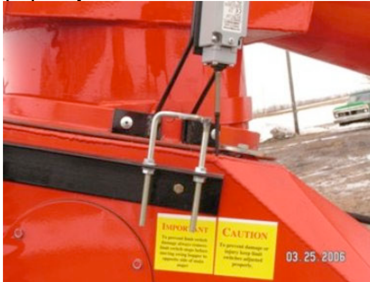
Whisker catching stop tab at least 1 ¼” or more

whisker of the limit switch. The cross bar should contact the whisker at least 1 ¼” or more. If the whisker does not contact the stop bar enough it will slip over the stop tab and the hopper will not stop. The whisker should also be close to centered horizontally on the stop tab. If for any reason these positions cannot be achieved with adjustment contact Rust Sales, Inc. immediately. Rust Sales, Inc. will not be responsible for any damage caused by improper adjustment of limit switches.