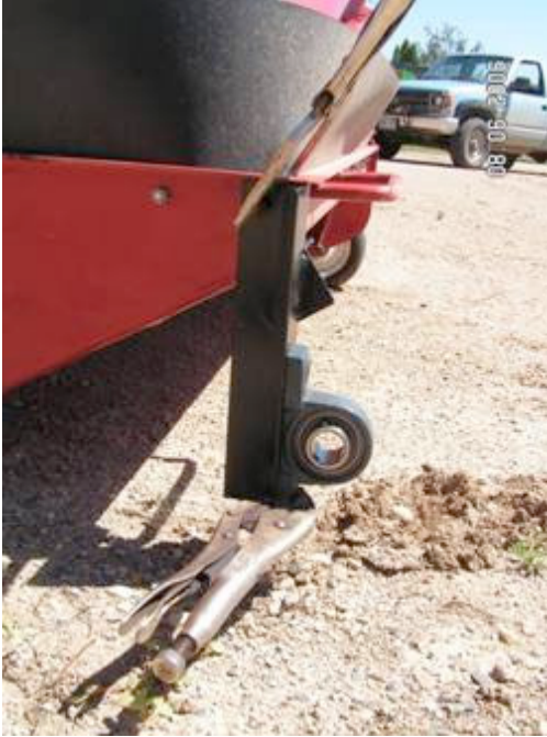
Picture showing bearing position

After getting holes drilled, mount pillow blocks with four \frac{3}{8} x 1\frac{1}{2} " and slide the axle shaft in to the bearings. Slide the hub and wheel assemblies on to the ends of the shaft. Position shaft so that the tires clear the hopper by 1" and leave 2-4" of shaft sticking past inside tire so the driveshaft can be mounted. (in some instances you can cut off one end or both ends of axle shaft if it is too long for your hopper.) Align wheel hub and shaft keyways, install \frac{1}{4} " key and tighten both wheels to shaft. Tighten both bearings to axle shaft. Cut the yellow axle protector to fit between the 2 pillow block bearings and slip on to shaft