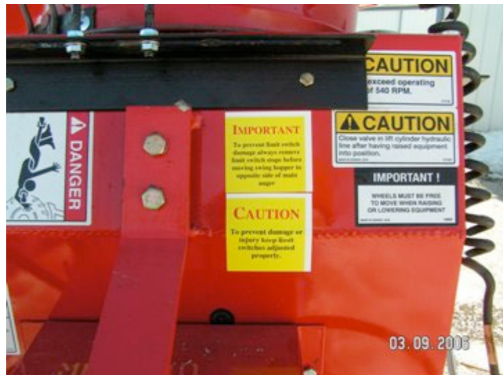
Place one each on the front of the auger boot.