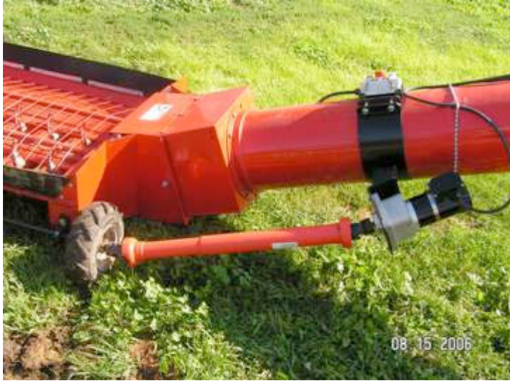
Complete motor and driveshaft and shield installed