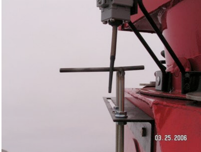
Side stop with long tab away from boot

CAUTION-- TO PREVENT DAMAGE ALWAYS REMOVE LIMIT SWITCH STOPS WHEN MOVING SWING HOPPER FROM ONE SIDE OF MAIN AUGER TO THE OTHER SIDE.