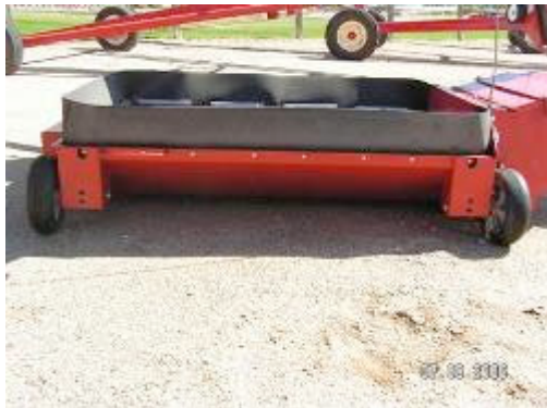
Hopper with 4 wheels and the Bearing mounts standard

On these augers there are a few different configurations of hoppers to mount the pillow block assemblies to. I tried to find every different configuration of these hoppers but if you have a hopper that is different contact Rust Sales, Inc.