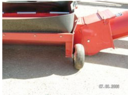
3 wheeled hopper where the angle iron mount will be bolted-typical 10"