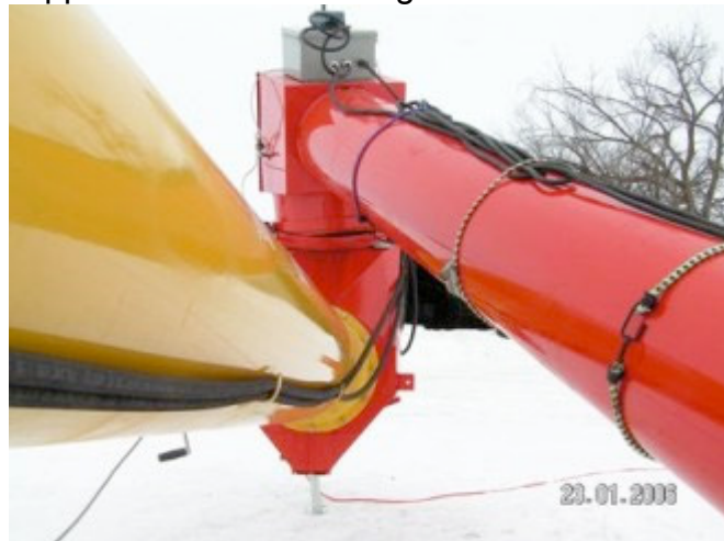
Swing hopper tube with 6” of clearance between main auger tube.

With swing hopper in its “home position” maintain 6” or more of clearance between swing hopper tube and main auger.