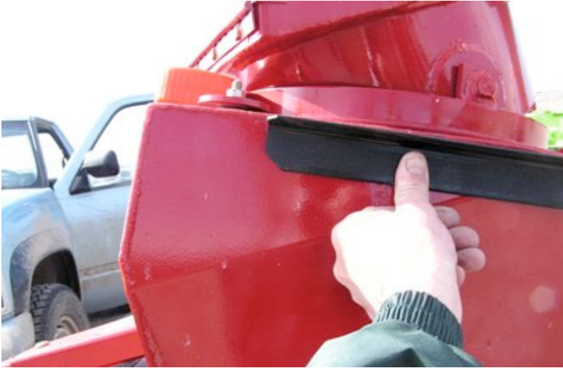
Bracket 4" from front of