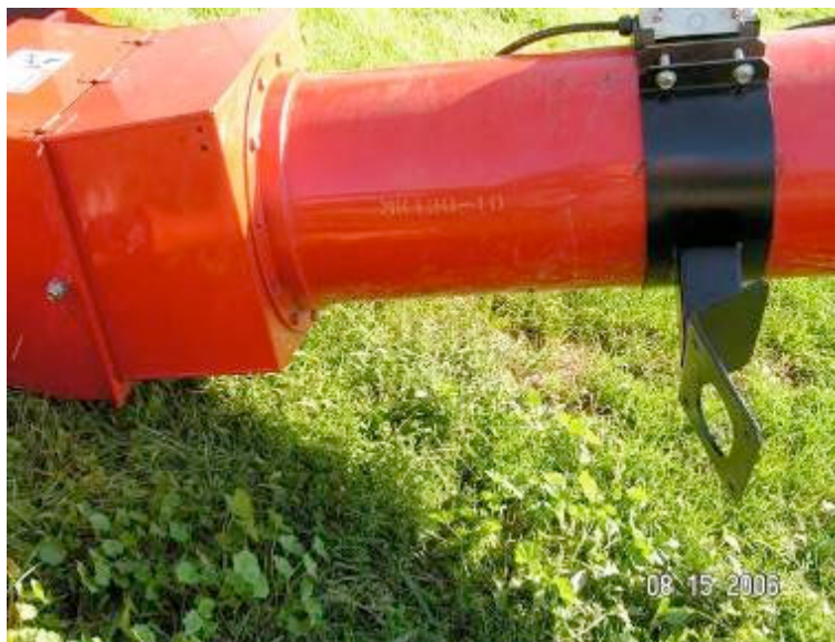
Picture showing proper mounting of motor mount - 15- 20" from intake of hopper

Place the motor mounting clamp around the auger tube approximately 15-20" from the intake of the hopper as shown in picture below. Use four 7/16" x 2" bolts to secure clamp to the auger tube.