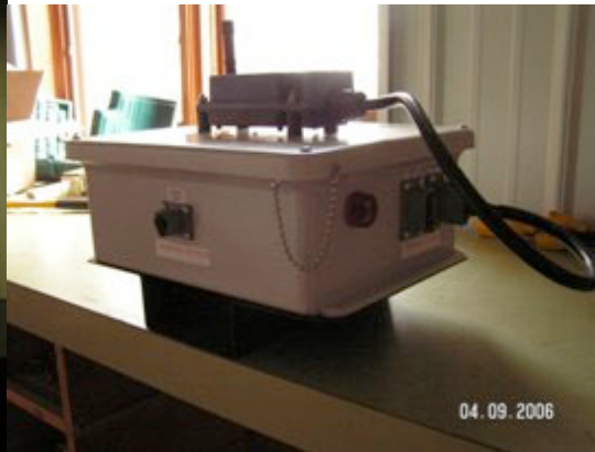
Control box on mounting bracket

Mount the control box on the bracket with 4 ¼" nuts. Make sure that the motor control outlet and lighted buzzer is facing the motor.