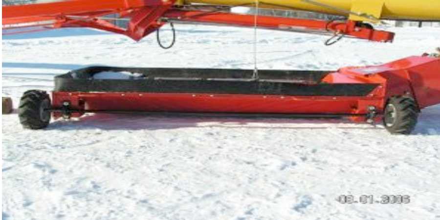
Similar picture showing bearings and axle and wheels assembled

Place the motor mounting clamp around the auger tube approximately 15-20" from the intake of the hopper as shown in picture below. Use four 7/16" x 2" bolts to secure clamp to the auger tube.