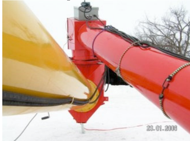
Swing hopper tube with 6" of clearance between main auger tube.

With swing hopper in its home position maintain 6" or more of clearance between swing hopper tube and main auger.